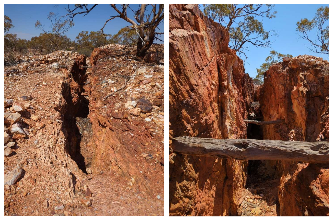
Figure 2. Old workings on E57/1254