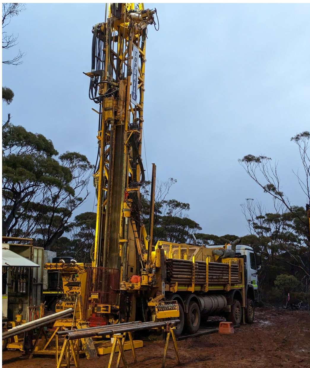
Figure 1 – Drill Rig onsite at Mt Palmer.